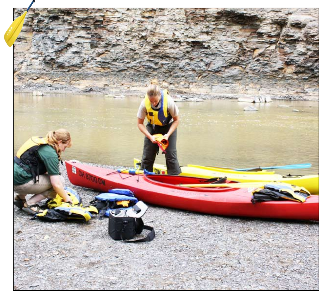
Rayaking on the Vermilion -Lorain Water Trail