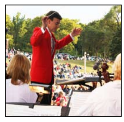
Cleveland Lops Lakeview Lark

The Vermilion - Lorain Water Trail became the fourth designated water trail in Ohio on July 1, 2009. The trail is 27 miles long and runs along the Vermilion River, Lake Erie and the Black River. The Water Trail is a partnership between the City of Vermilion, the City of Lorain, the Vermilion Port Authority, the Lorain Port Authority, and the Ohio Department of Natural Resources Division of Watercraft and Division of Wildlife.